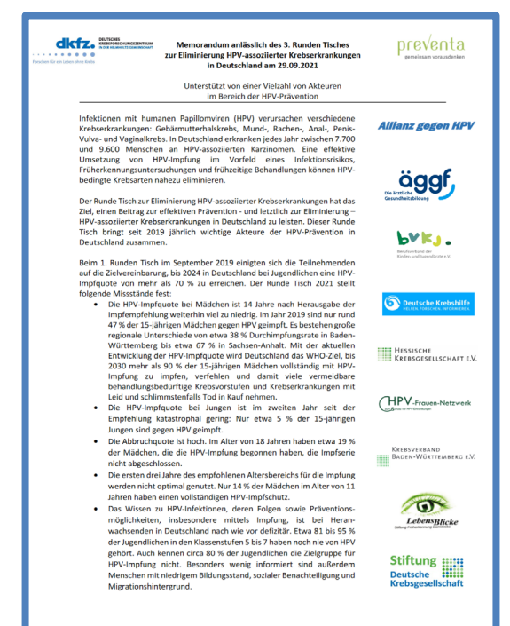
Figure 3: Memorandum from the 3rd Roundtable